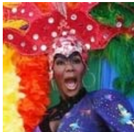
Motor City Pride at Hart Plaza