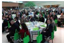
2011 Michigan Green Leaders awards Apr. 21, 2011